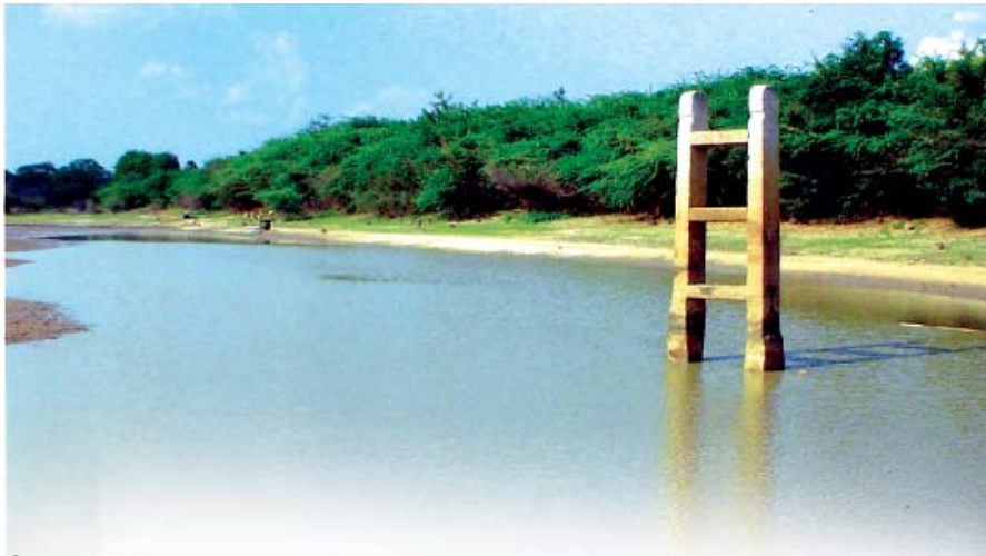
Fig. 5 A ninth century sluiceway in Tamil Nadu. It regulated the outflow of water from a tank into the channels that irrigated the fields.

flooding and canals had to be constructed to carry water to the fields. In many areas two crops were grown in a year.