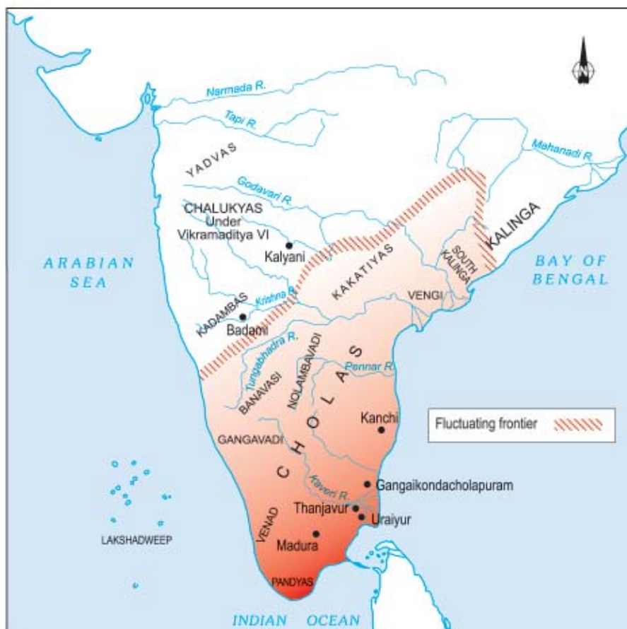
Map 2 The Chola kingdom and its neighbours