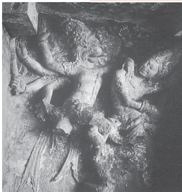
Fig. 1 Wall relief from Cave 15, Ellora, showing Vishnu as Narasimha, the man-lion. It is a work of the Rashtrakuta period.

Many of these new kings adopted high-sounding titles such as maharaja-adhiraja (great king, overlord of kings), tribhuvana-chakravartin (lord of the three worlds) and so on. However, in spite of such claims,