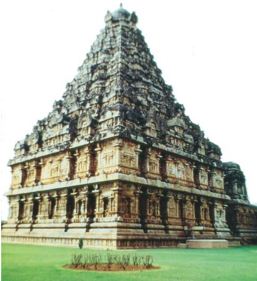
Fig. 3 The temple at Gangaikondacholapuram. Notice the way in which the roof tapers. Also look at the elaborate stone sculptures used to decorate the outer walls.

Chola temples often became the nuclei of settlements which grew around them. These were centres of craft production. Temples were also endowed with land by rulers as well as by others. The produce of this land